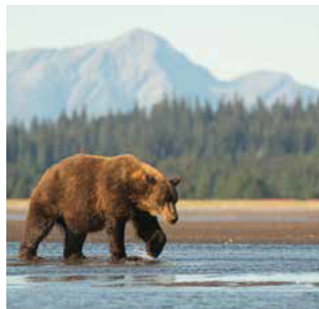
GRIZZLY BEAR, YELLOWSTONE NATIONAL PARK