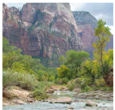
ZION NATIONAL PARK