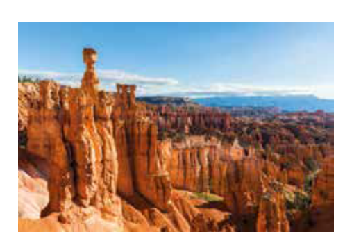
TOP RATED HIGHLIGHT Hoodoos. (Day 5, Bryce Canyon National Park)