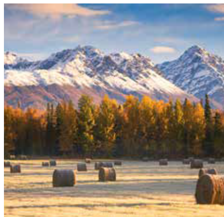
MATANUSKA VALLEY FARM