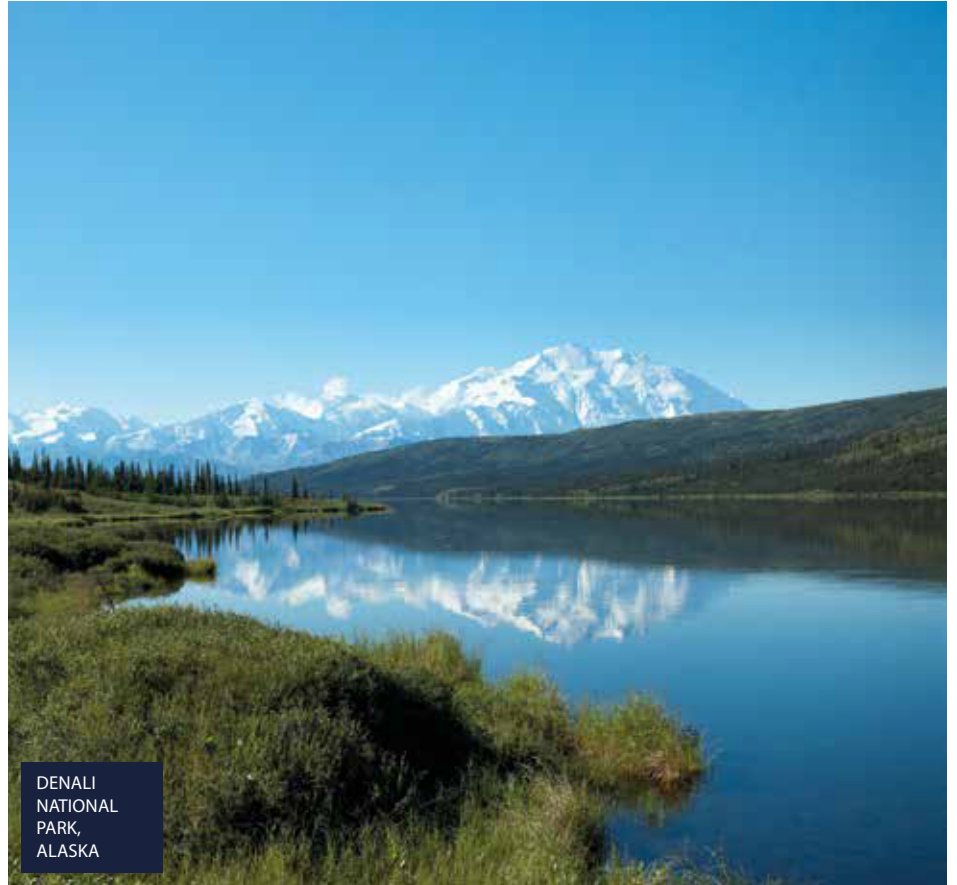
DENALI NATIONAL PARK, ALASKA