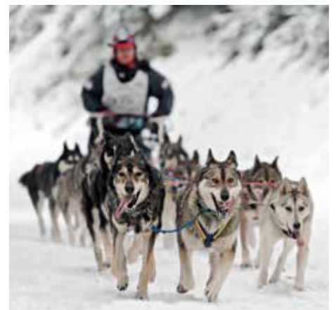
IDITAROD RACER HUSKIES