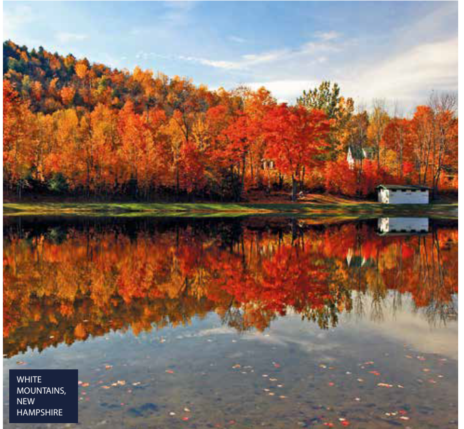
WHITE MOUNTAINS, NEW HAMPSHIRE