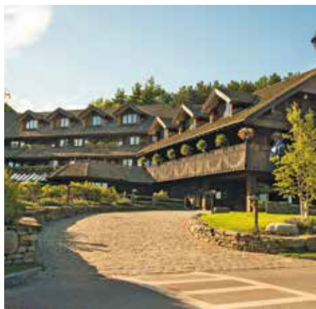
TRAPP FAMILY LODGE