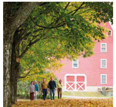
BILLINGS FARM & MUSEUM