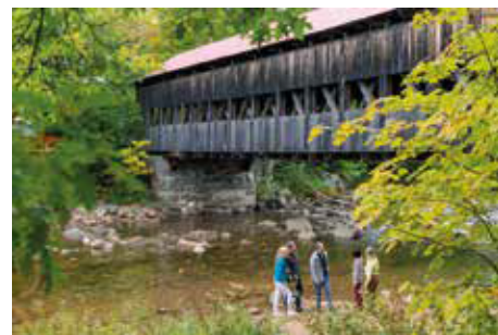
TOP RATED HIGHLIGHT Covered bridge, Kancamagus Scenic Byway. (Day 5, New Hampshire)

Known for its sandy beaches, Kennebunkport is a year-round coastal destination that houses the rich and famous, even serving as the summer retreat of former President George H.W. Bush. Travel along Ocean Drive with more stunning views of the Maine coastline, before driving back to Boston. Guests departing Boston will arrive at Boston Logan International Airport at 12:30. Those extending their stay will return to the Hyatt Regency Boston hotel. (B)