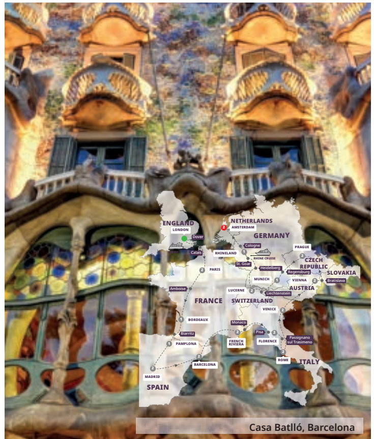
Casa Batlló, Barcelona