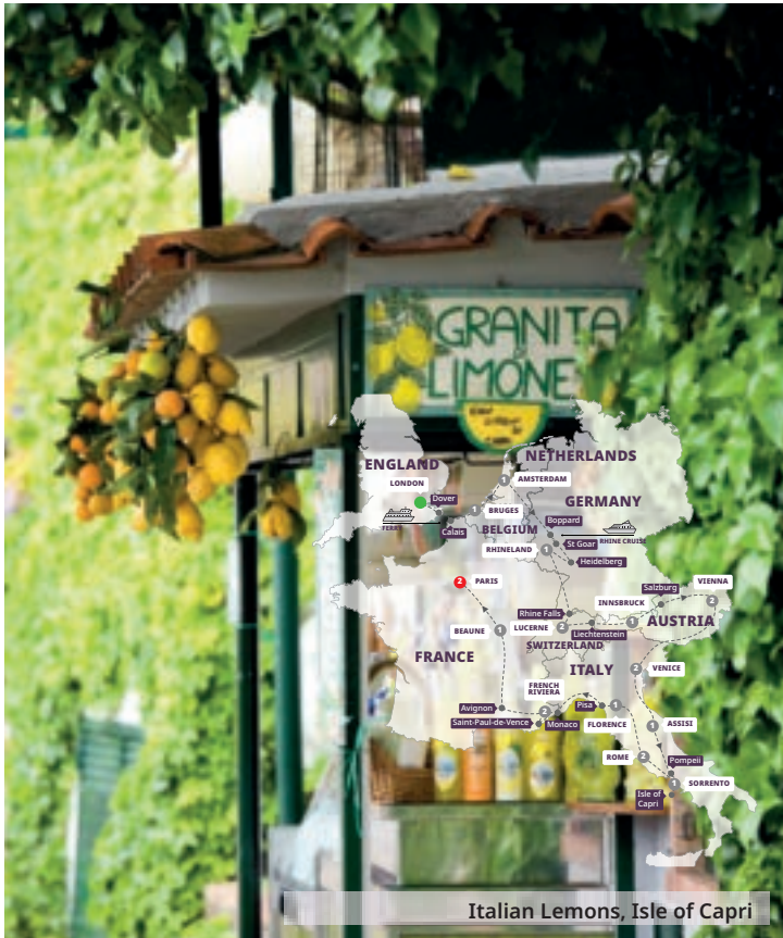
Italian Lemons, Isle of Capri