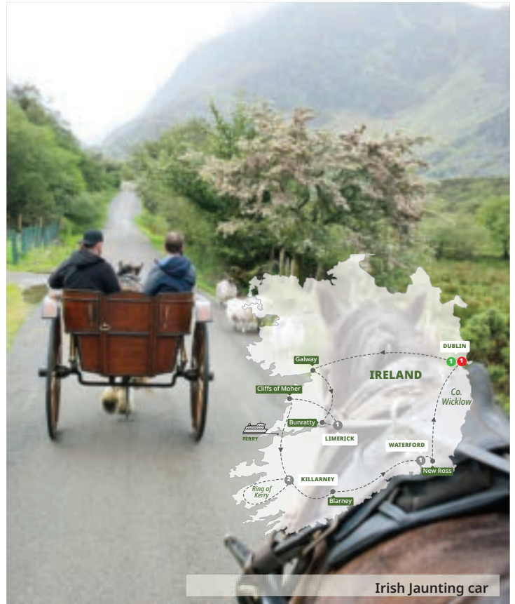
Irish Jaunting car