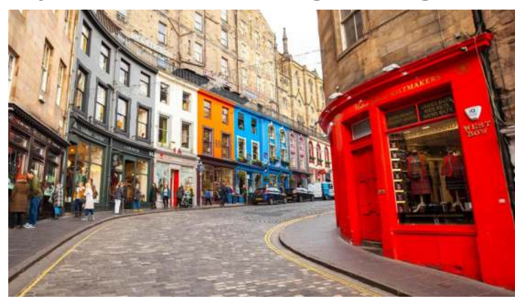
Day 2 | Discover Enchanting Edinburgh

Let your Local Specialist take you on an informative sightseeing tour of Edinburgh. See the regal Palace of Holyroodhouse, the new Scottish Parliament Building and the Royal Mile, delving into the heart of the city, before visiting Edinburgh Castle, perched atop Castle Rock. Stroll through the grand New Town with its Gothic façades enjoying the rest of the day at leisure. Tickets to see the Edinburgh Tattoo are included on departures that coincide with performance dates.