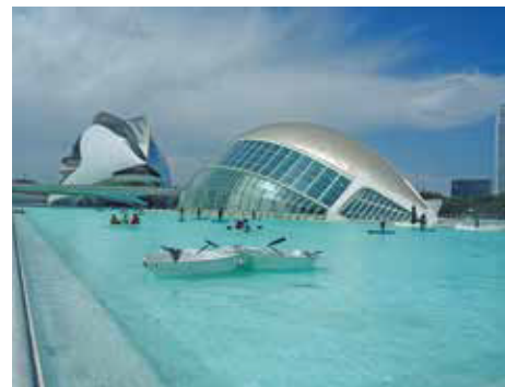
TOP RATED HIGHLIGHT See the modern City of Arts and Sciences. (Day 12, Valencia)

Departure transfers arrive at Barcelona airport at 07:00, 09:00 or 11:00. The 09:00 transfer continues on to Madrid airport and hotel in the early evening. (B)