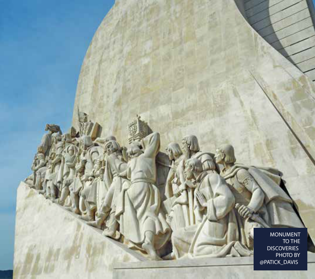
MONUMENT TO THE DISCOVERIES