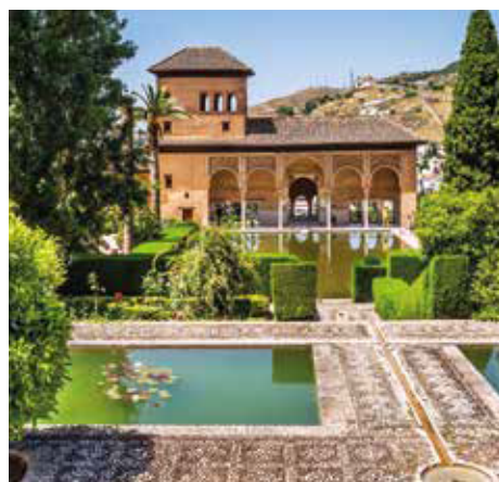
ALHAMBRA PALACE, GRANADA