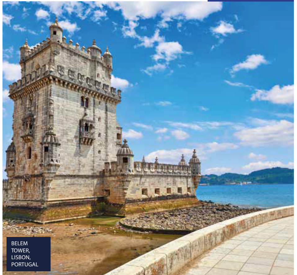
BELEM TOWER, LISBON, PORTUGAL