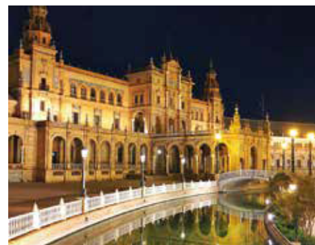
TOP RATED HIGHLIGHT Take a chance to see Plaza de España during your time in Seville. (Photo by @Travelling_insighttim, Day 3, Seville)