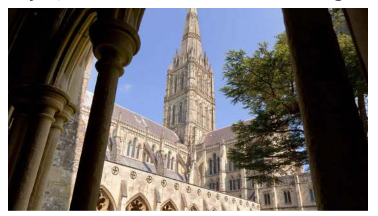
Day 6 | Onwards to Prehistoric Stonehenge and London

This morning, visit the ancient monoliths at Stonehenge, which rise imposingly on Salisbury Plain, imagining a time when pagans and druids would gather in their mysterious midst. We'll visit the town of Salisbury, home to Britain's tallest spire, before returning to London where our memorable journey through Devon and Cornwall comes to an end.