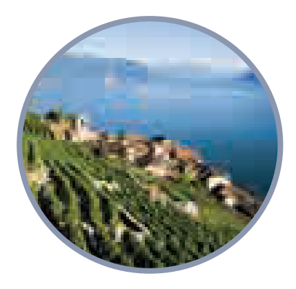
Wine tasting with views of Lake Geneva and the Alps. Enjoy local vintages and cheeses with a Swiss family on their family wine farm. Learn more at trafalgar.com.