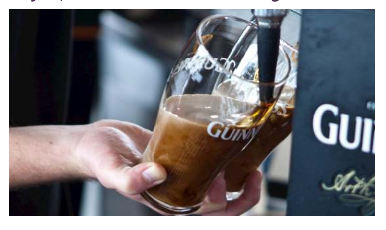
Day 9 | Admire Dublin's Iconic Sights

Dive Into Culture and visit the Guinness Storehouse to learn about Ireland's famous brew, before delving into Dublin's iconic sights with a Local Specialist. See Trinity College, St. Patrick's Cathedral and the stately Georgian Squares. Enjoy the rest of the day at leisure or consider an Optional Experience at an Irish Cabaret.