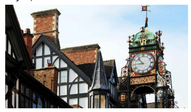
Day 8 | Across the Irish Sea to Dublin

The half-timbered Tudor Rows in Chester are our first stop today as we travel to Holyhead in North Wales to catch our ferry across the Irish Sea to Dublin. Soak up Irish hospitality and delicious local flavours during a Regional Dinner at EPIC - the Irish Emigration Museum.