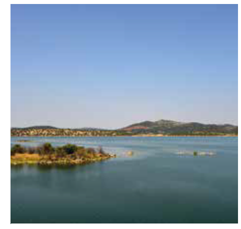
MONSARAZ CRUISE, ALQUEVA DAM RESERVOIR