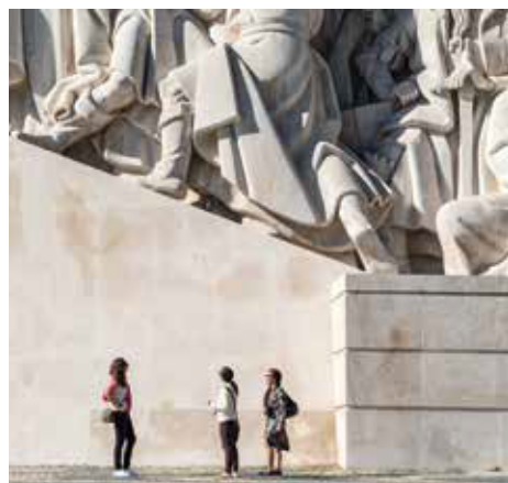
MONUMENT TO THE DISCOVERIES, LISBON