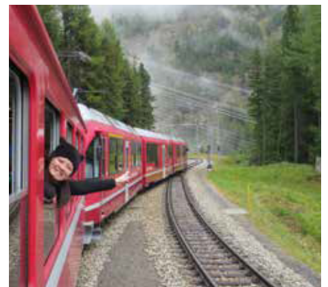
@IMSTILLAKIDATHEART, GLACIER EXPRESS