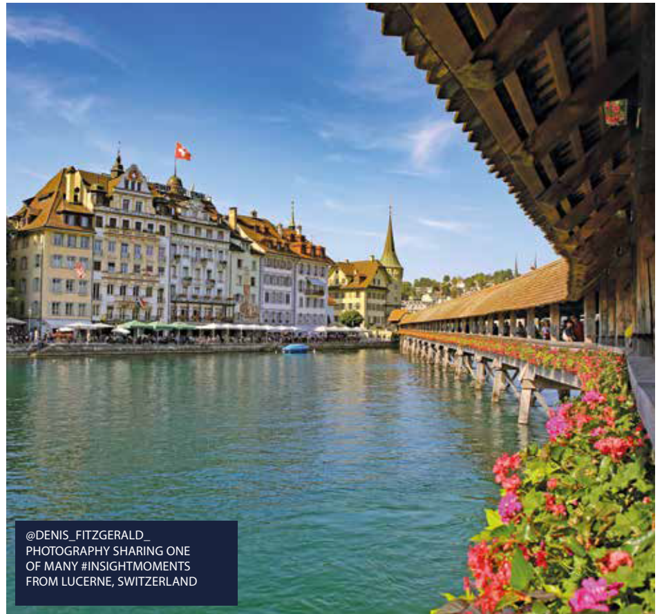
SHARING ONE OF MANY #INSIGHTMOMENTS FROM LUCERNE, SWITZERLAND