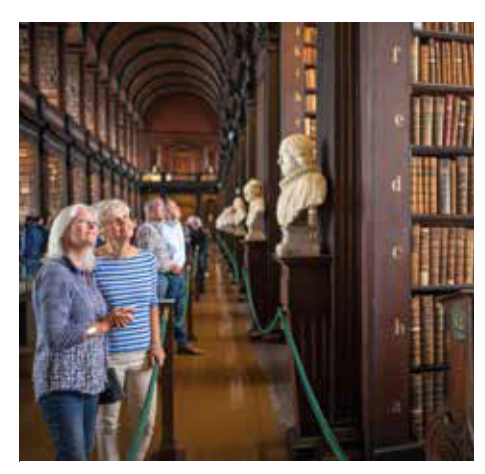
TRINITY COLLEGE, DUBLIN