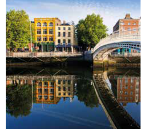
HA'PENNY BRIDGE, DUBLIN