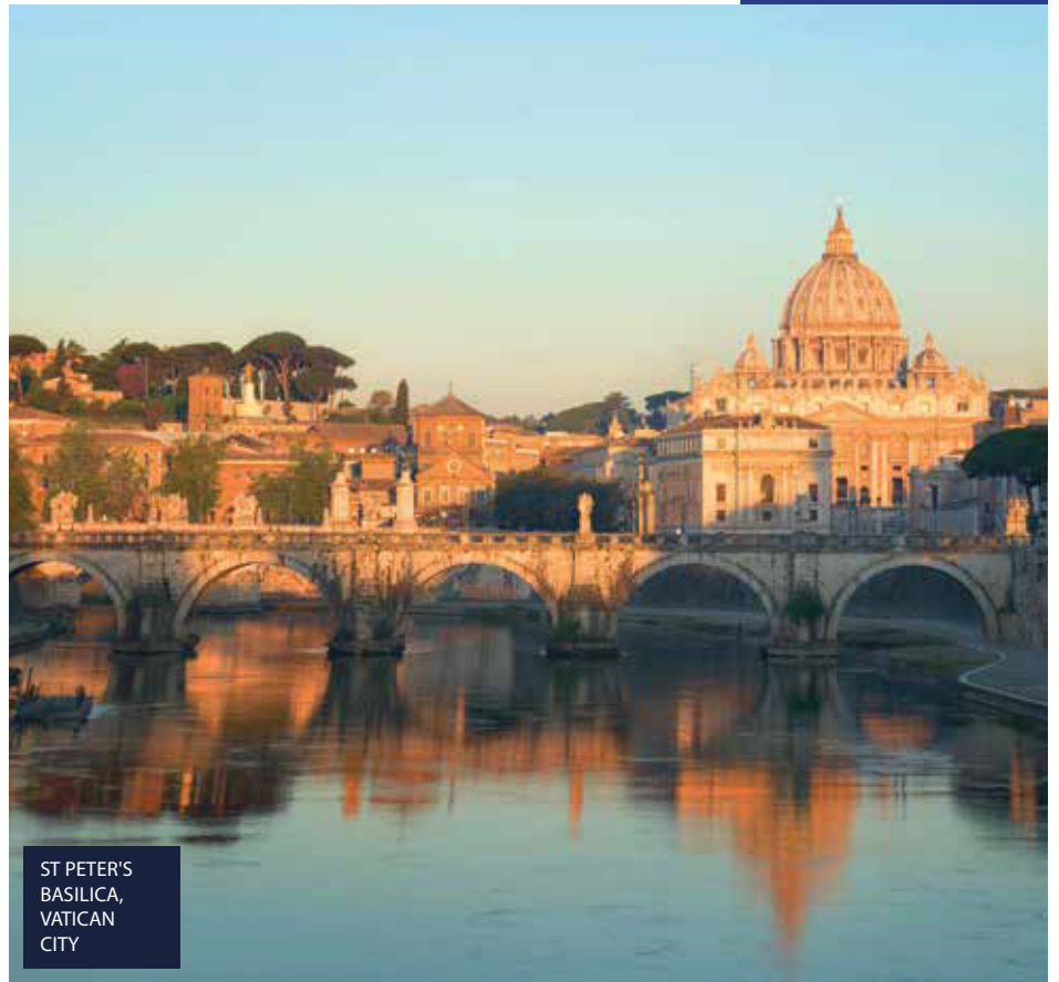
ST PETER'S BASILICA, VATICAN CITY