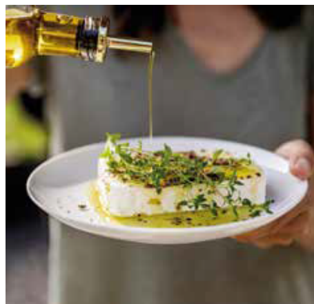
OLIVE OIL, ITALY