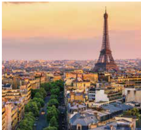
EIFFEL TOWER, PARIS