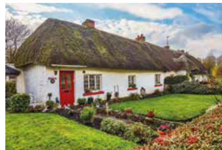
TOP RATED HIGHLIGHT See Adare's thatched cottages. (Day 3, Adare)

Your memorable trip comes to an end. Departure transfers arrive at Dublin airport at 07:00, 09:00 and 10:30. (B)