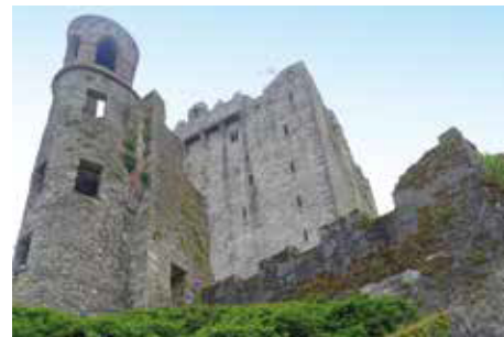
TOP RATED HIGHLIGHT Visit Blarney Castle and kiss the Blarney Stone. (Day 5, Blarney)