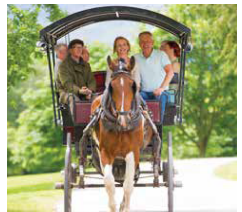
JAUNTING CAR, KILLARNEY