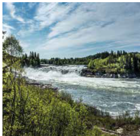
LAKSFORSEN WATERFALL, NORWAY