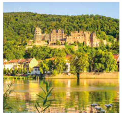
HEIDELBERG CASTLE, GERMANY