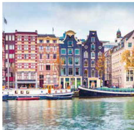
AMSTERDAM, THE NETHERLANDS