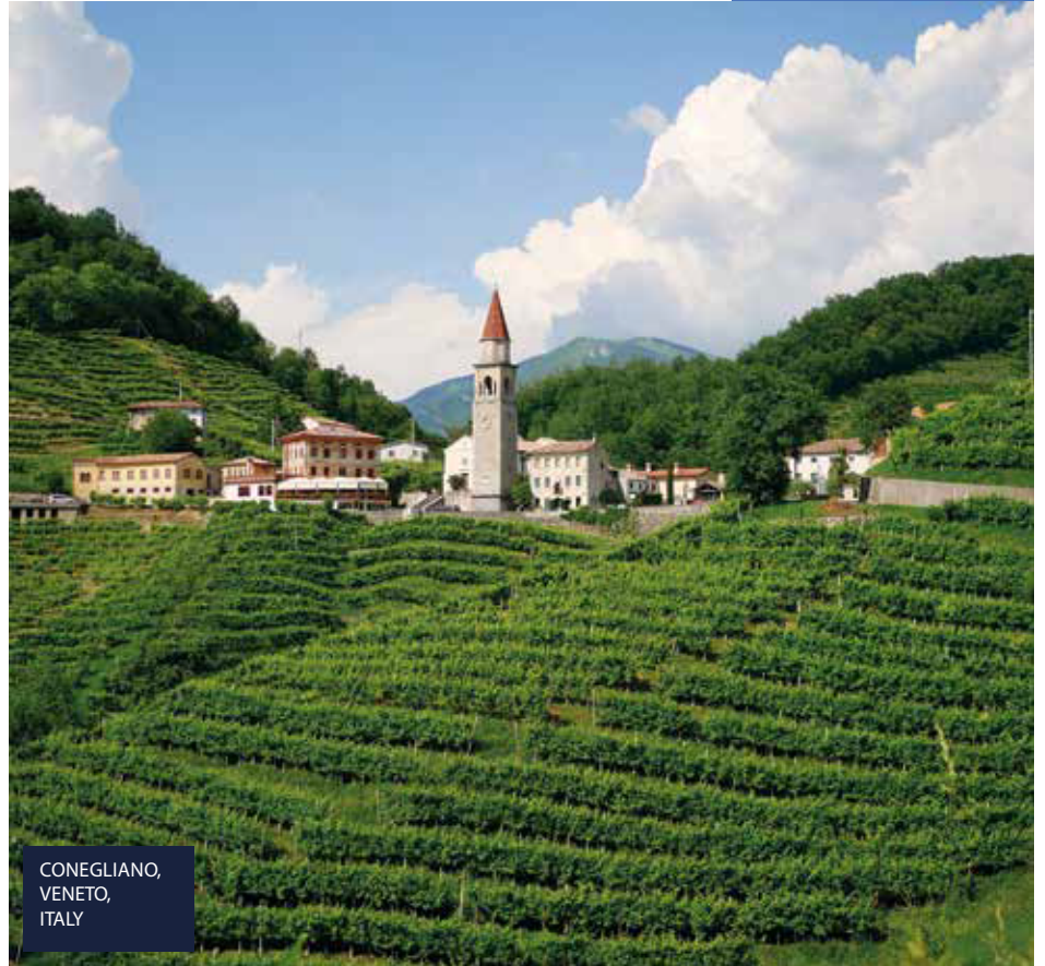
CONEGLIANO, VENETO, ITALY