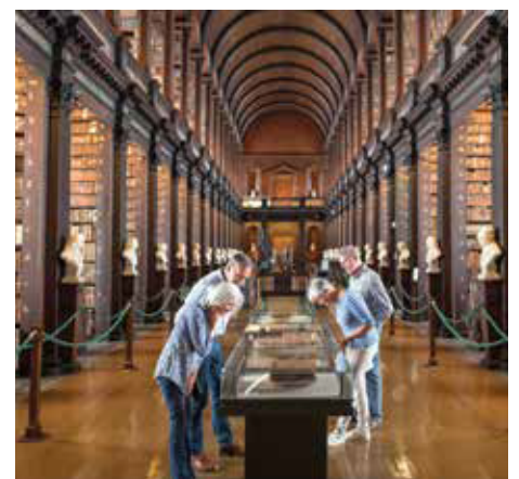
TRINITY COLLEGE, DUBLIN