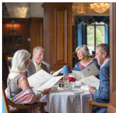
AUTHENTIC DINING, ASHFORD CASTLE