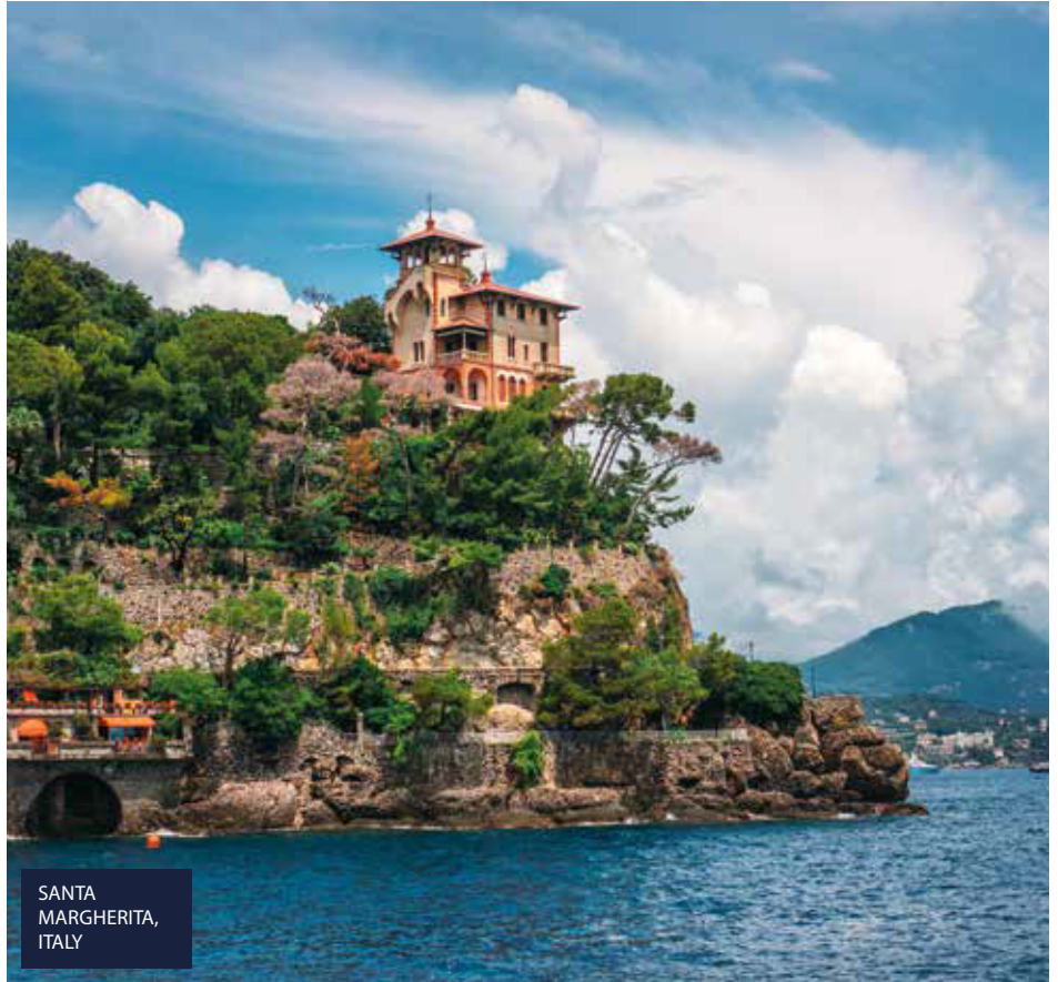
SANTA MARGHERITA, ITALY