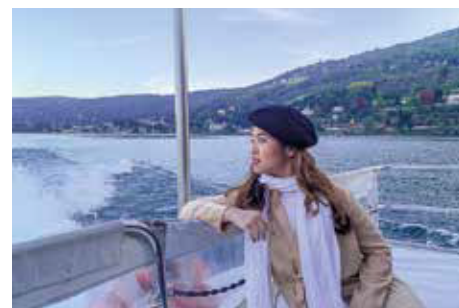
OPTIONAL EXPERIENCE Cruise Lake Maggiore to explore the Barromean Islands. (Day 5, Lake Maggiore)

This trip operates both classic and small group departures. You can also book your own private group with as few as 12 travellers.