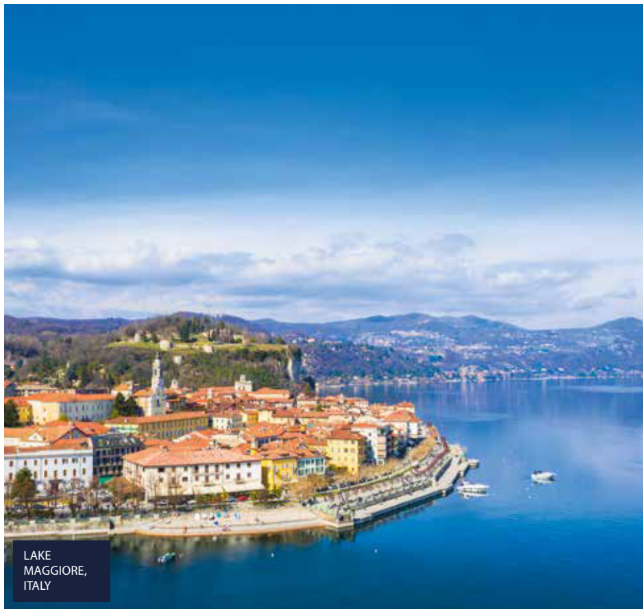
LAKE MAGGIORE, ITALY