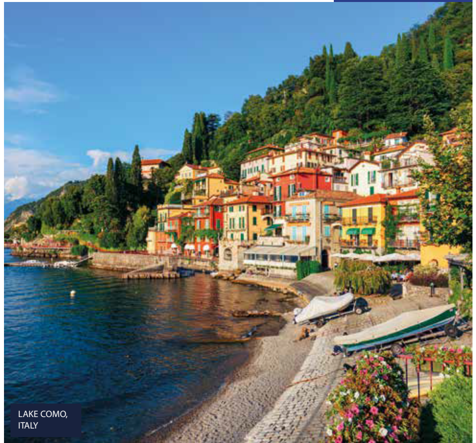
LAKE COMO, ITALY