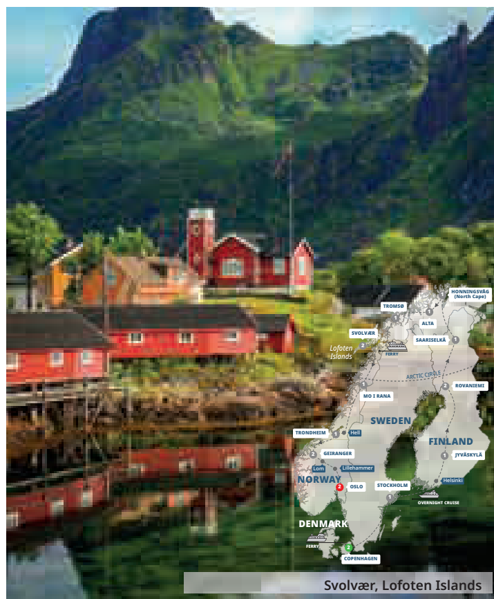
Svolvær, Lofoten Islands