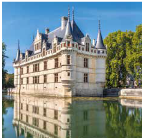
CHÂTEAU D'AZAY-LE-RIDEAU, LOIRE VALLEY