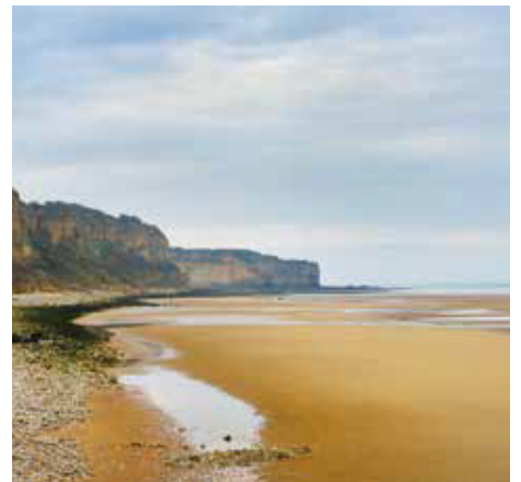
OMAHA BEACH, NORMANDY