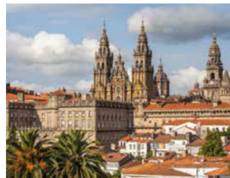
INSIGHT CHOICE Visit Santiago de Compostela Cathedral with a Local Expert. (Day 4, Santiago de Compostela)

Departure transfers arrive at Barcelona airport at 07:00, 09:00 or 11:00. The 09:00 transfer continues on to Madrid airport and hotel in the early evening.(B)