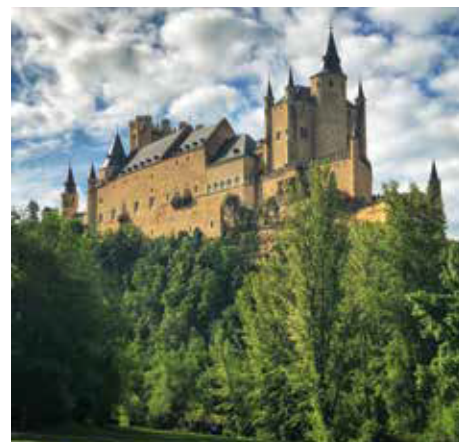
@LEANNE4874, SEGOVIA'S ALCAZAR, (OPTIONAL)