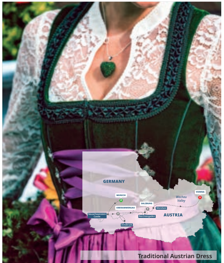
Traditional Austrian Dress