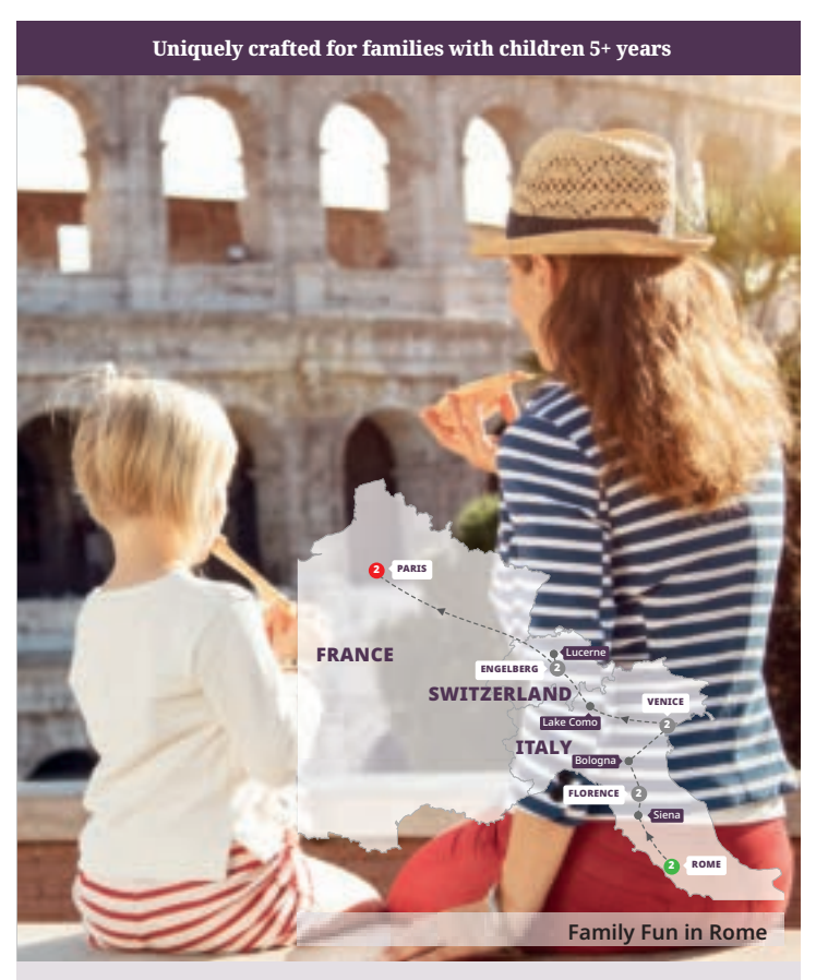
© See what happens on trip: #TTEuropeanWonderland

Bring history to life on your European travels as you learn about life as a Roman gladiator and try your hand at pizzamaking on an epic European family trip filled with carnival masks, medieval castle banquets and tons of fun for the whole family.