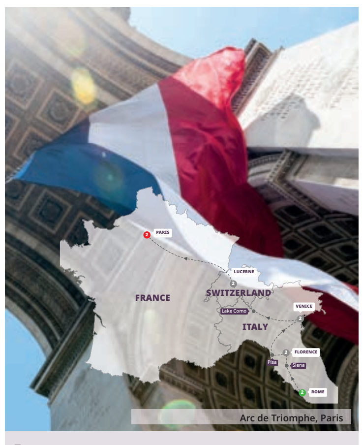
See what happens on trip: #TTEuropeanSplendour

When have you ever had the opportunity to dine with an Italian count in Tuscany? That's not all you'll do on this exciting Rome to Paris trip, bringing you the bright lights of the Champs-Élysées, the Leaning Tower of Pisa and the epic skyline from Florence's Piazzale Michelangelo.