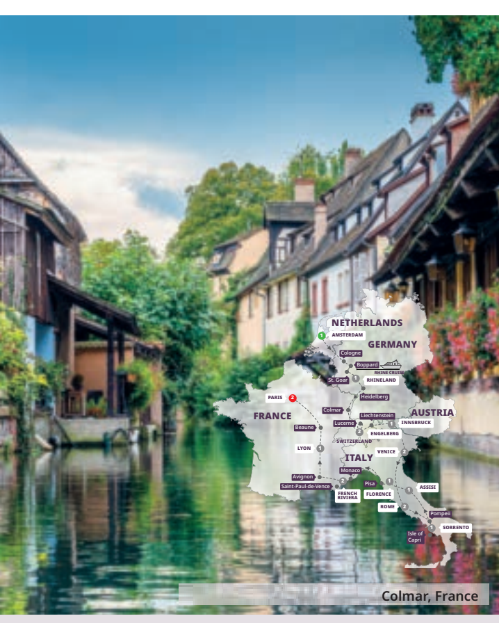
See what happens on trip: #TTTraditionalEurope

Lose yourself in the history and romance of Traditional Europe. You'll see all the iconic sights and some beautiful surprises along this three-week European trip taking in the exquisite beauty of the Rhine Valley, the snow-capped Alps and the decadently warm waters of the French Riviera.