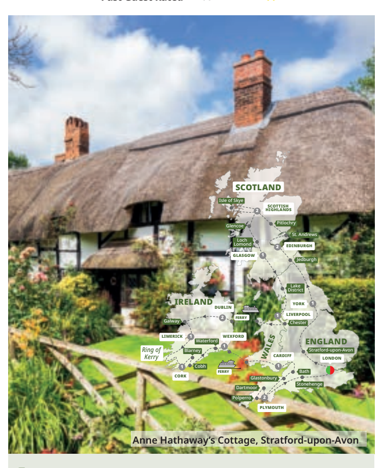
© See what happens on trip: #TTGBEIPanorama

Dive right into history, culture and spectacular scenery on this immersive England, Scotland, Wales and Ireland trip. Step in the shoes of Highland warriors, 12th-century monks and welcoming, warm Irish locals who'll share the beauty and stories of their islands just for you.