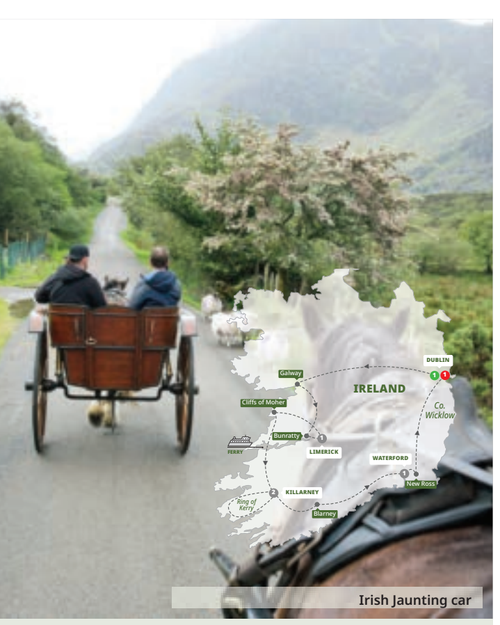
© See what happens on trip: #TTIrishHighlights

A roundtrip from Dublin featuring all the Ireland highlights including Waterford's crystal, your newfound 'gift of the gab' at Blarney Castle and the irresistible Ring of Kerry. You'll also learn about the devastating Irish famine and peer over the edge at the Cliffs of Moher.