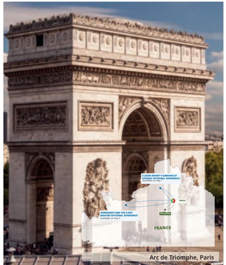
Arc de Triomphe, Paris