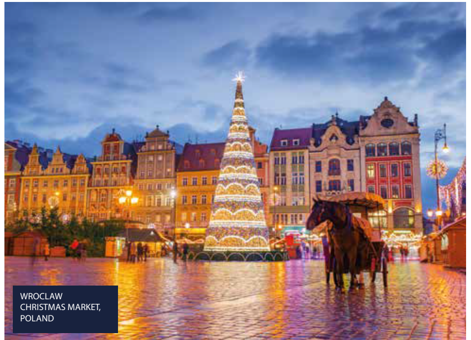
WROCLAW CHRISTMAS MARKET, POLAND