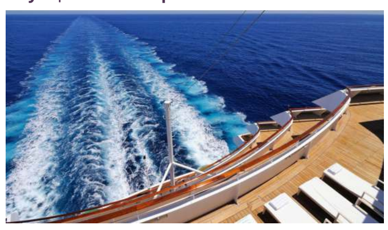
Day 5 | Off to Nikopolis and Sail to Corfu

We leave the Peninsula and return to mainland Greece. continuing north past Amphilochia and Preveza, before arriving in Nikopolis to see where the Battle of Actium took place. Boarding a ferry, we cross to the beautiful island of Corfu where we have some time at leisure to admire its splendid architecture, arcades and Spianada, one of the largest and most impressive squares in Greece.