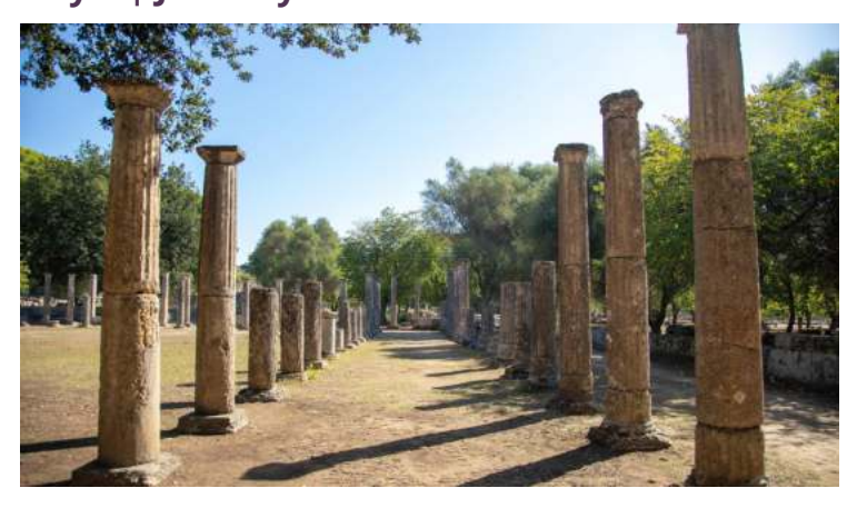
Day 8 | Journey to Meteora and Mount Pelion

The delicious flavours of Metsovone cheese provide a fitting start to our day. We continue to Kalambaka where a Local Specialist will reveal the famous Byzantine Monasteries of Meteora that stand almost impossibly perched atop colossal boulders. Pass the seaside town of Volos before arriving into Portaria.