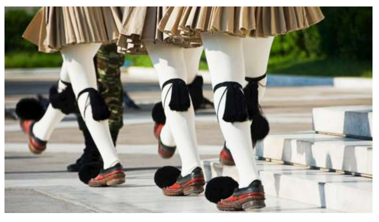
Day 11 | Farewell Athens

We bid farewell to Athens and newfound friends as we prepare to depart Greece. Find out more about your free airport transfer at trafalgar.com/freetransfers.