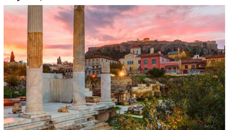
Day 10 | Return to Athens

We return to cosmopolitan Athens for a day of delving into antiquity, coming face-to-face with the treasures of Ancient Greece. We ascend to the Acropolis and join a Local Specialist for a sightseeing tour with magnificent views of Athena's Parthenon, the Agora, Royal Palace and Temple of Zeus. See Hadrian's Arch, built to celebrate the arrival of the Roman Emperor Hadrian, and view the stadium where the first modern Olympics took place in 1896. On our final evening together, we join our fellow travellers for a Farewell Dinner to celebrate the millennia and miles explored together on this epic voyage of discovery.