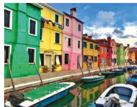
TOP RATED HIGHLIGHT See the picturesque fishing village of Burano (Photo by @skinnylynn, Day 10, Burano)