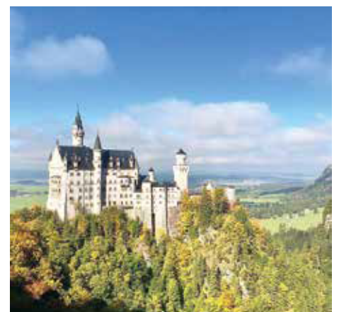
@LANGSTER1706, NEUSCHWANSTEIN CASTLE