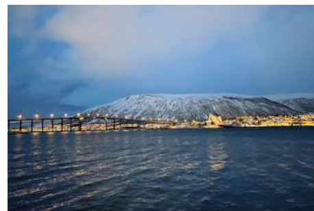
TOP RATED HIGHLIGHT Discover beautiful scenery in Tromsø with your Travel Director. (Photo by Yeo Yong Meng, Day 7, Tromsø)