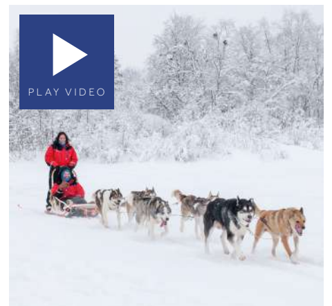
DOG SLEDDING (OPTIONAL)