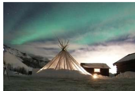
TOP RATED HIGHLIGHT Witness the wonder of the Aurora Borealis. (Day 2, Ivalo)