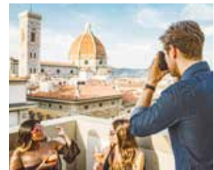
Revel in Renaissance architecture, Florence