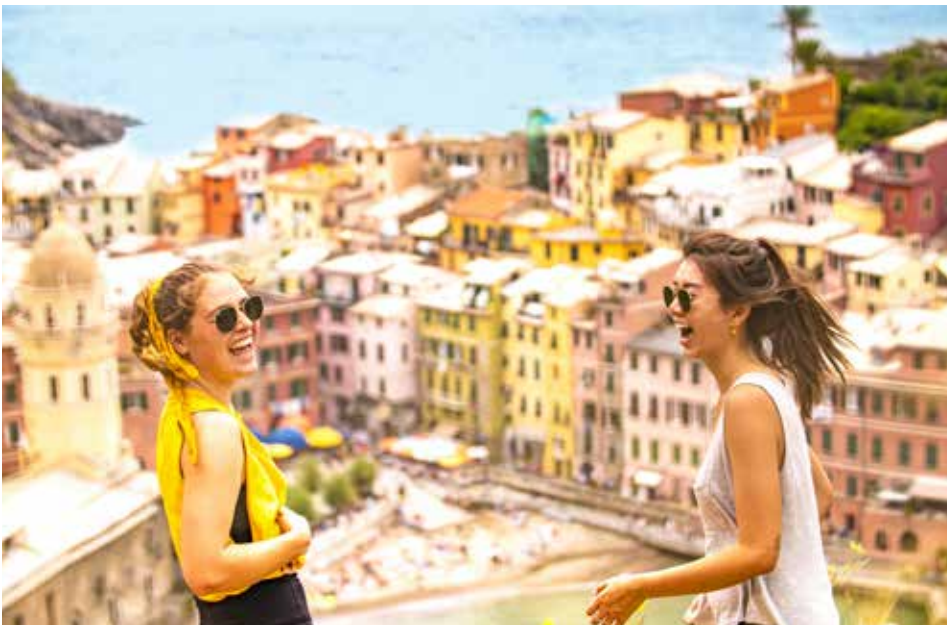
Explore the postcard-perfect seaside villages of Cinque Terre, Italy

The one that gives you 15 days of pure Italian bliss