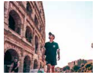
Discover history at the Colosseum, Rome