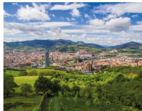
AUTHENTIC DINING Mount Artxanda, Bilbao. (Photo by @Danminsighttd, Day 5, San Sebastian)