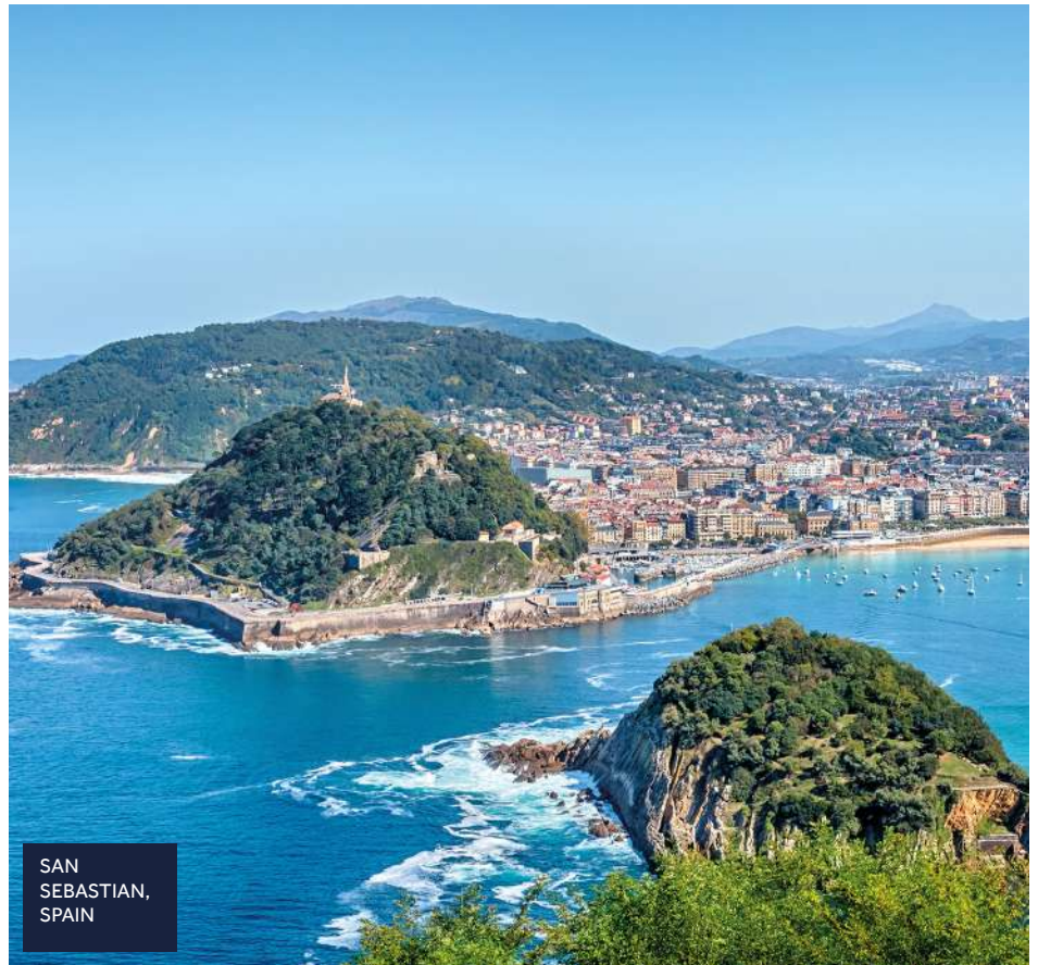
SAN SEBASTIAN, SPAIN