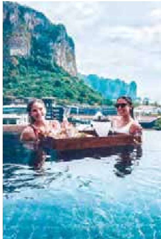
AVANI AO NANG CLIFF KRABI RESORT

Located on the white sands of Krabi's Long Beach, this dreamy resort includes an infinity pool & delicious Thai restaurant overlooking the sea.