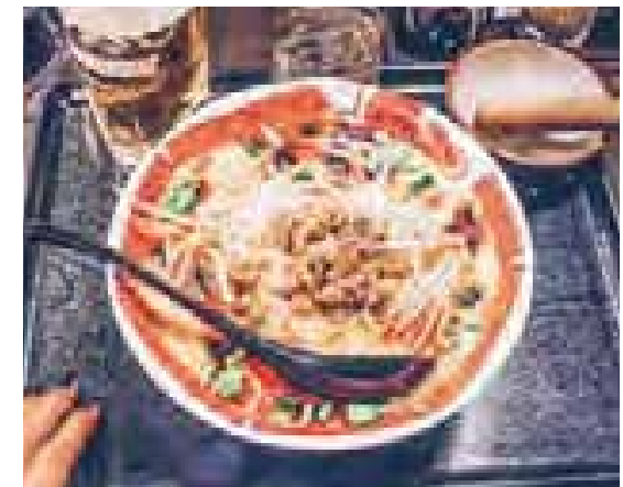
Savour street eats, Osaka, Japan @pourlesfilles