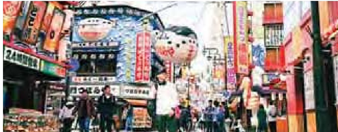
Discover lively Dotonbori, Osaka, Japan