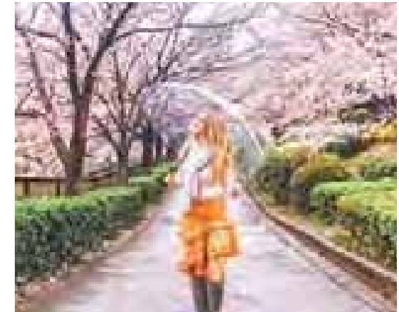
Fall for the charms of cherry blossom season, Osaka, Japan