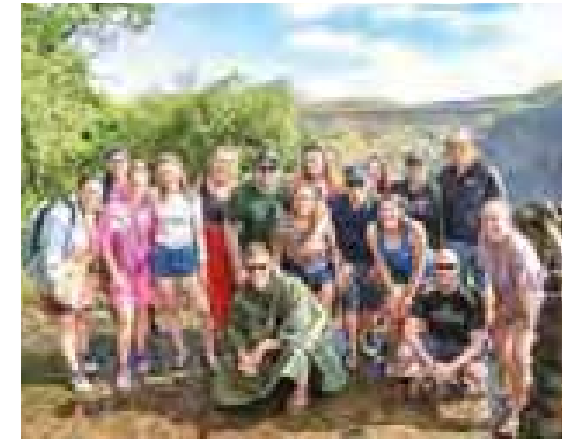
Walk along Victoria Falls, Zimbabwe