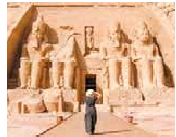
Marvel at the Temple of Ramses II, Abu Simbel

SEE FULL TRIP DETAILS AT CONTIKI.COM/EGYPT