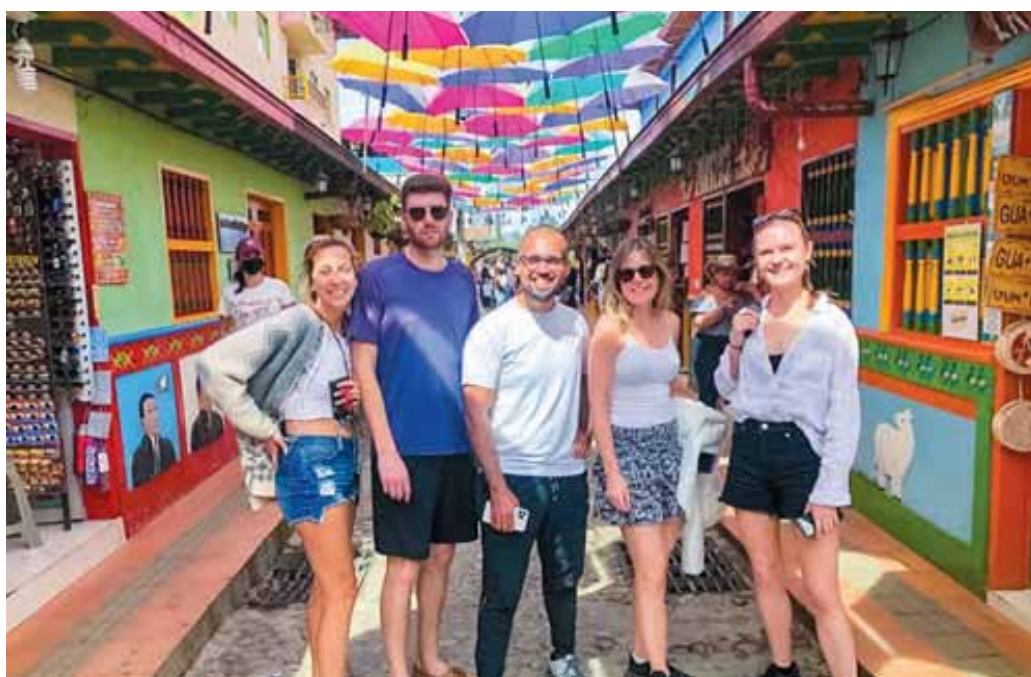
Explore Colombia's famous walled city & stand under its umbrellas, Cartagena

THE ONE THAT GIVES YOU ALL THE BEST OF COLOMBIA IN 12 DAYS, FROM CARIBBEAN COASTLINES TO COLOURFUL TOWNS