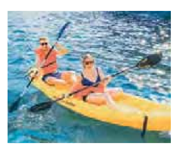
See penguins, turtles and sea lions on a kayak trip, Isabela island