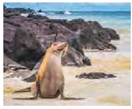
Meet the locals on Isabela Island, Ecuador @amy-perez