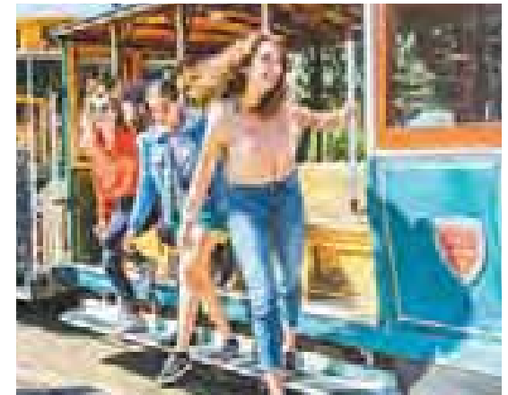
Ride a trolley car downhill in San Francisco, California, USA