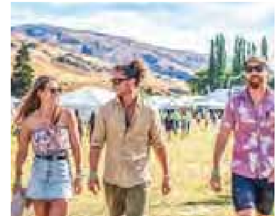
Glamp it up with VIP festival passes, Queenstown, New Zealand