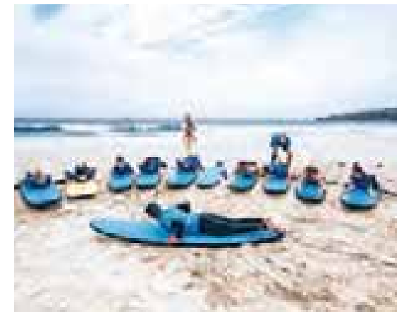
Learn to surf at Byron Bay, New South Wales

SEE FULL TRIP DETAILS AT CONTIKI.COM/BEACHES