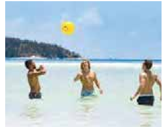
Take a trip to a tropical paradise, Whitsundays, Queensland